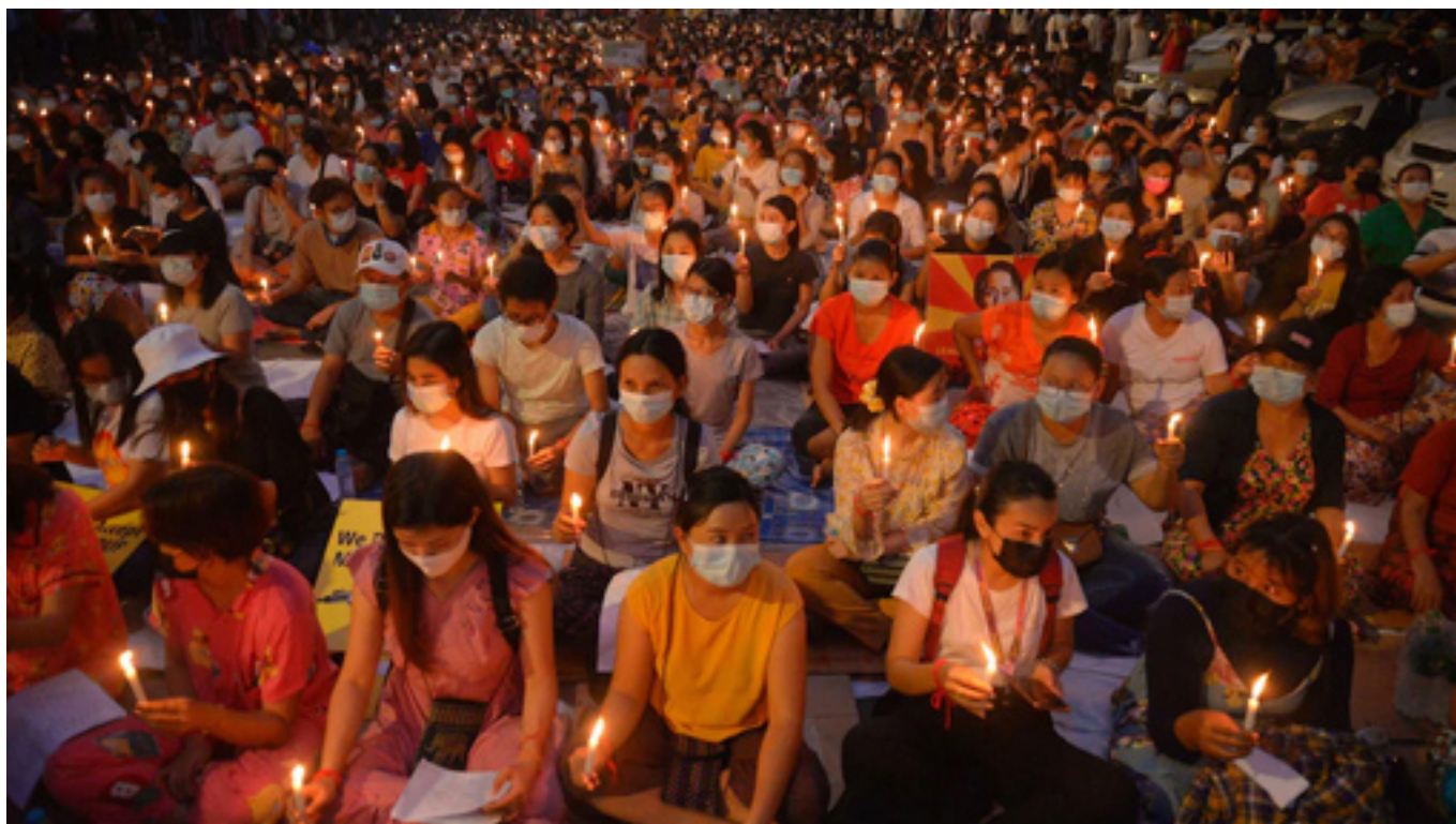
Brave people of Myanmar peacefully protesting against the ruthless Military dictatorship