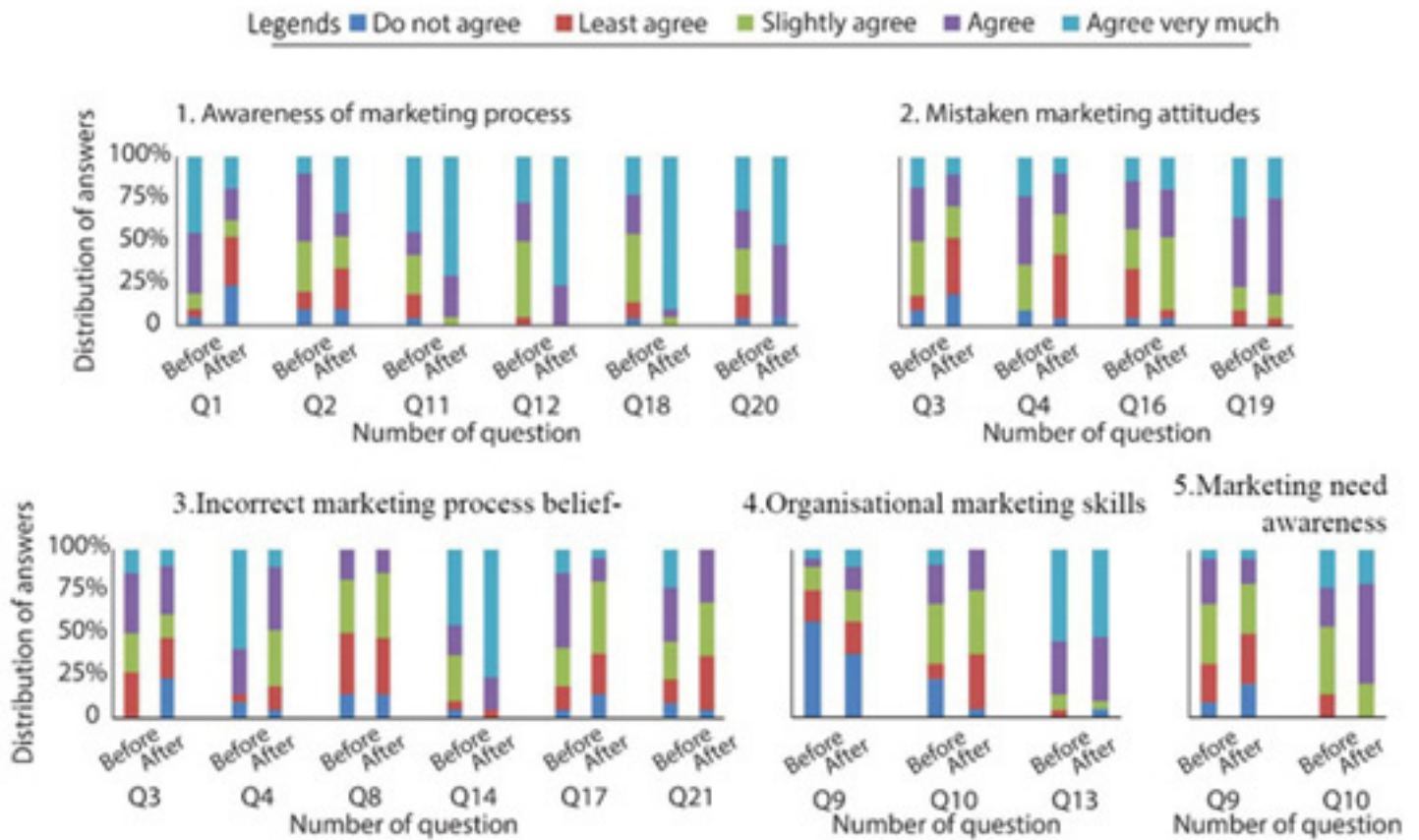
Figure 1: Distribution of answers by variable

that 50% were males and 45.5% were females. One participant did not answer the question about gender. The majority (63%) of participants had a college education; a minority (16%) had only elementary-level education.