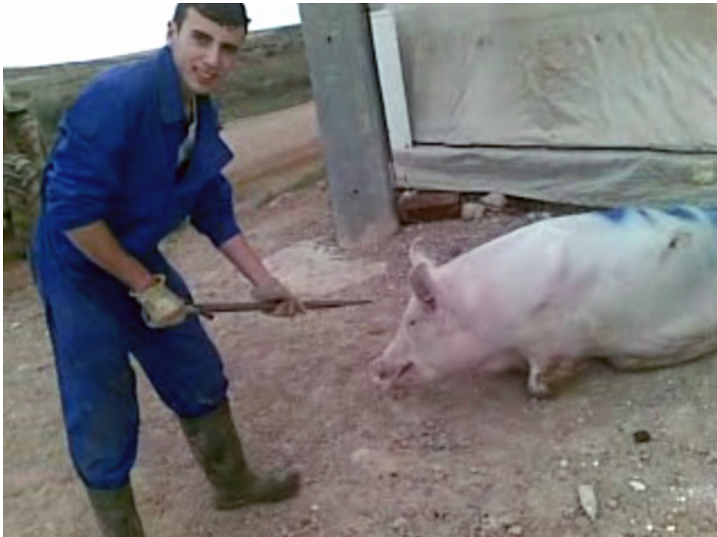
"Selfies" torturing a pig

So let us look at some more of the handiwork of the great human race, in their dealings with the rest of our planetary life forms and decide if we can do much better (following pages)