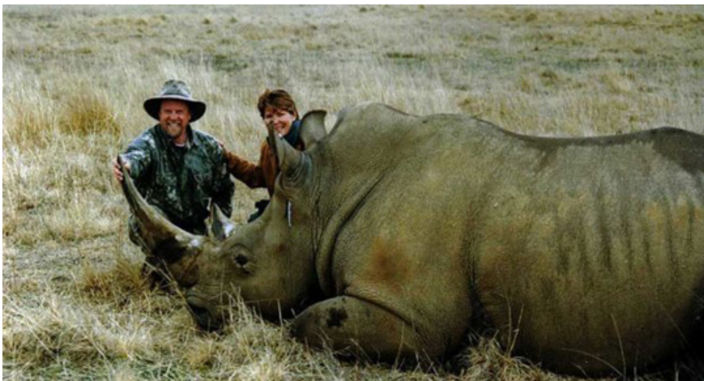
All killed for fun