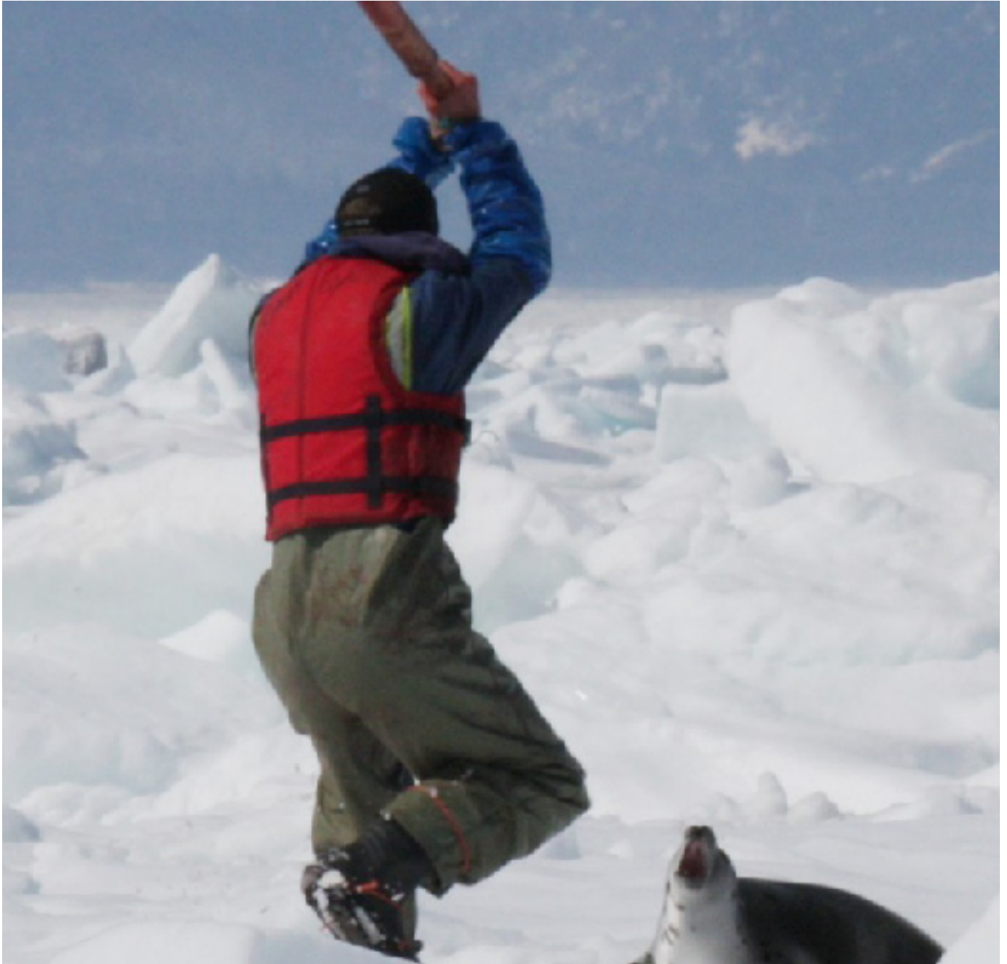
The fur trade