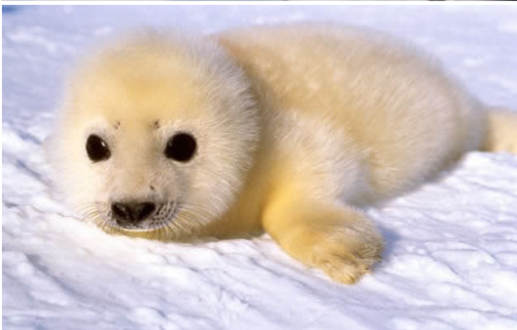
Baby fur seal