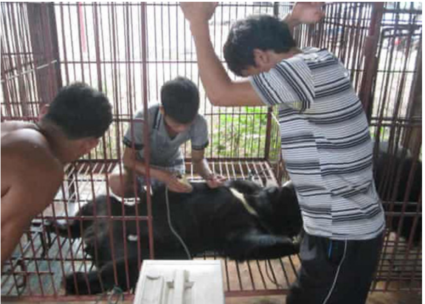
Not helping a bear - draining its bile instead