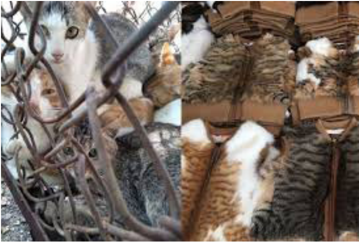
Boiled or skinned alive for their fur