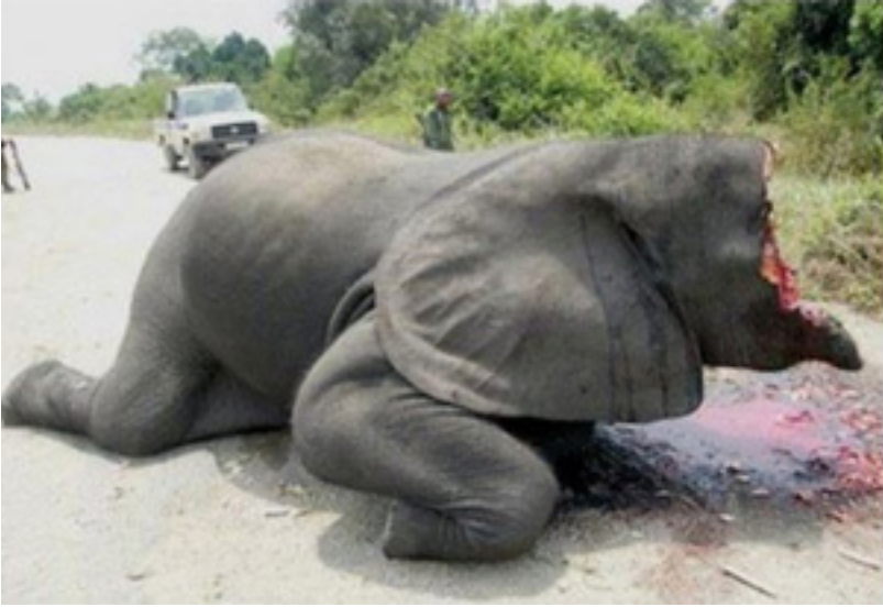
Killed for the illegal ivory trade