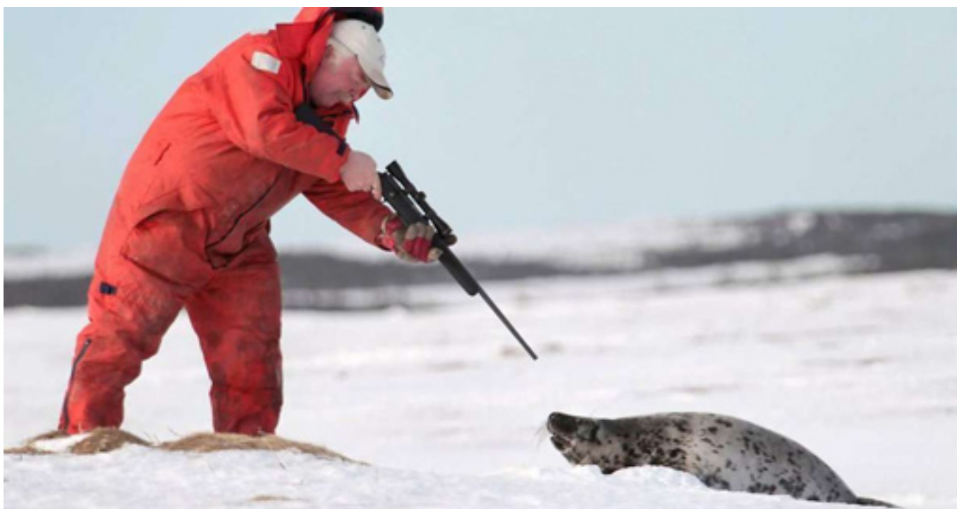
Big man kills little seal and three men with guns kill one unarmed leopard