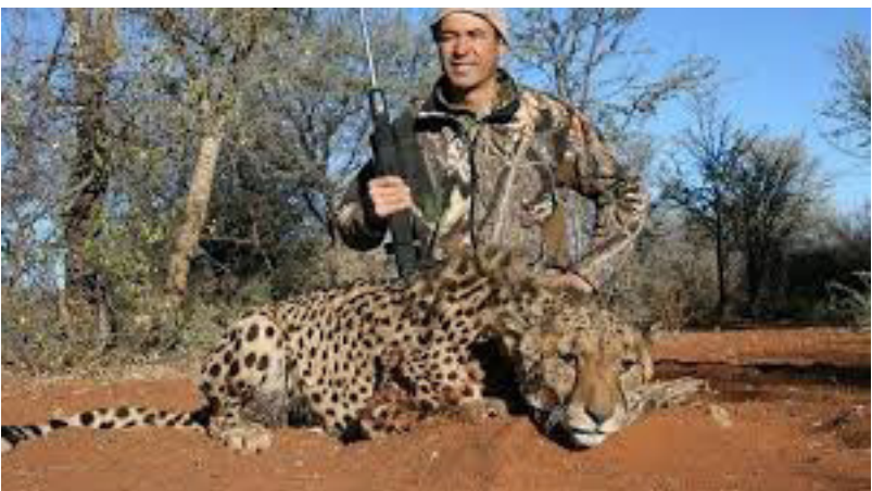
Killed for fun