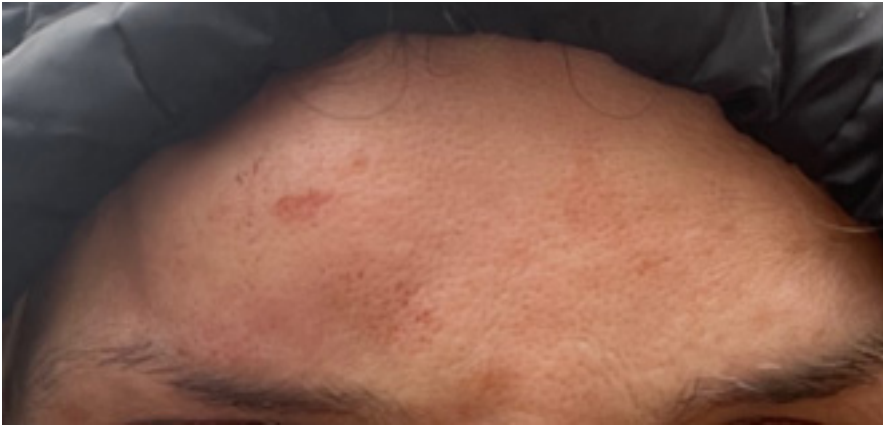
Forehead immediately after being struck