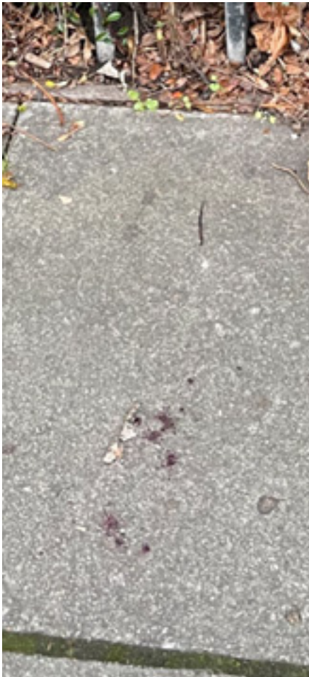
Figure 2 My blood at the collision area close to the iron railings, stayed as such in the area for more than 2 weeks ©

I didn't know how this man could do this to me when the footpath is quite long enough to avoid me and bypass me. He didn't apologise or show a sense of guilt at all and just left me and fled the scene without calling the ambulance or the police for me, as if he had done nothing illegitimately.